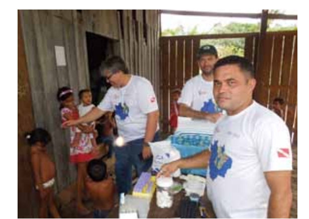
Visiting the home of a child diagnosed with leprosy to examine household contacts in Oriximiná, Pará

As well as active surveillance for clinical signs of leprosy, we are trying to develop tests to