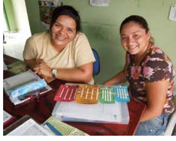
(Far left) Dr. Salgado writes up a prescription for MDT for a child diagnosed with leprosy in Oriximiná, Pará; (left) nurses at the local school, where MDT is provided free of charge

determine biomarkers of infection and disease progression. We have been testing several protein antigens and also the well-known phenolic glycolipid I (PGL-I) antigen. Individuals with a strong positive response to PGL-I, indicating infection with the bacteria causing leprosy, have been found to have an eight-fold higher risk of succumbing to the disease.